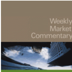
Weekly Market Commentary

Did you know that you can click on the pictures below for valuable information?