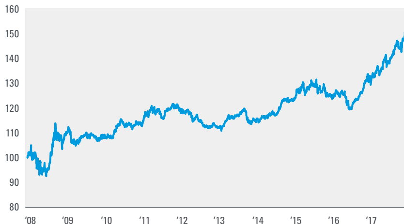
● Russell 1000 Growth Index Relative to Russell 1000 Value Index